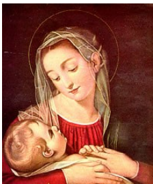
Mary, Mother of God January 1