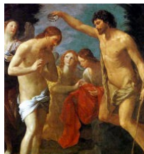
Baptism of Jesus January 9