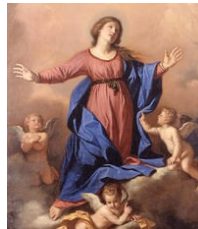
The Assumption August 15