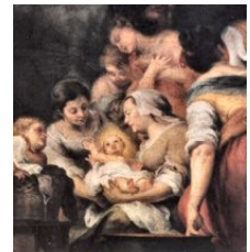
The Birth of Mary September 8